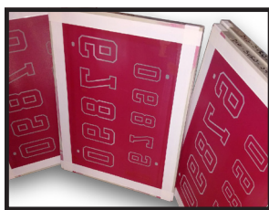
Complete kits include pre-exposed screens. Choose from 7 available fonts.

Film positives, blank screens also available